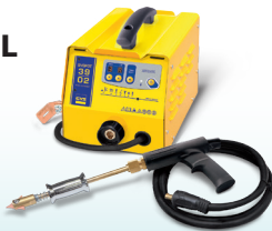
SPEEDLINER 39.02 - ref. 035010 SPEEDLINER 39.04 - ref. 035027