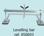
Levelling bar ref. 050693