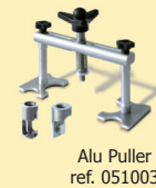
Alu Puller ref. 051003