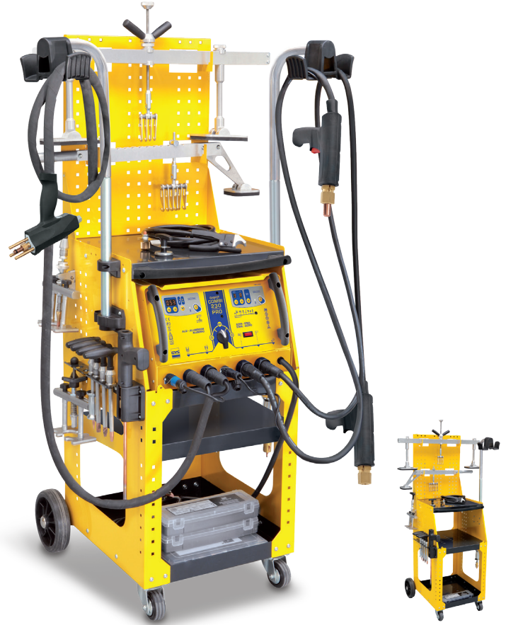
Without generator Ref. 035058