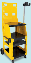
Spot 1600 trolley ref. 051348