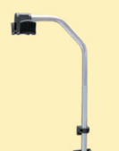
Cable hanger ref. 052284