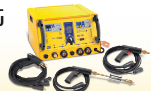
SPEEDLINER Combi 230 E PRO - ref. 035072