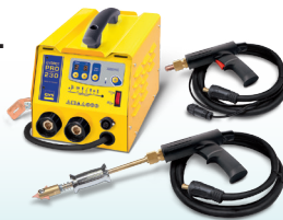
SPEEDLINER PRO 230 - ref. 035034 SPEEDLINER PRO 400 - ref. 035041