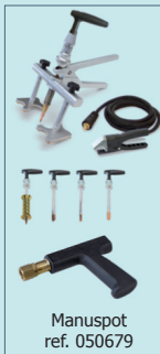
Manuspot ref. 050679